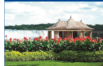
Visit beautiful Queen Victoria Park

Departure: Frank White Education Center, 204 Helten Ave, Park Rapids, MN @ 8 am