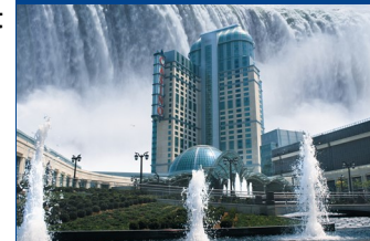
Gaming at Fallsview Casino