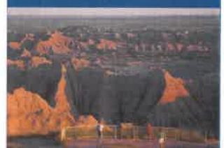
Spectacular Badlands National Park