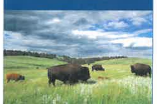
Wildlife enhances the pristine Black Hills