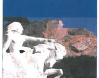
Crazy Horse Monument to be 10x the size of Mt. Rushmore