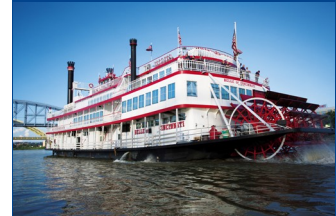
Enjoy a BB Riverboats Sightseeing Cruise