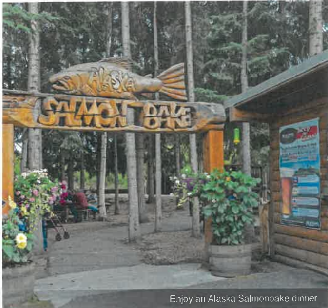
Enjoy an Alaska Salmonbake dinner

DAY 1 Fly to Fairbanks: Your flight to the “Land of the Midnight Sun” takes you to Fairbanks, Alaska, where your Tour Manager greets you at the hotel. The first day of travel will come to a quiet close as you explore the new surroundings and prepare for your adventure.